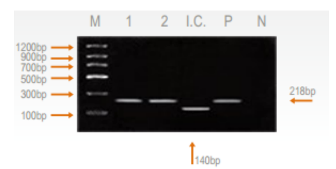
Fig. 1 Result:

Lane M: Brig? Molecular Weight Marker Lane 1~2: A. orthoreovirus Positive samples Lane I.C.: Internal control Lane P: Positive control Lane N: Negative control